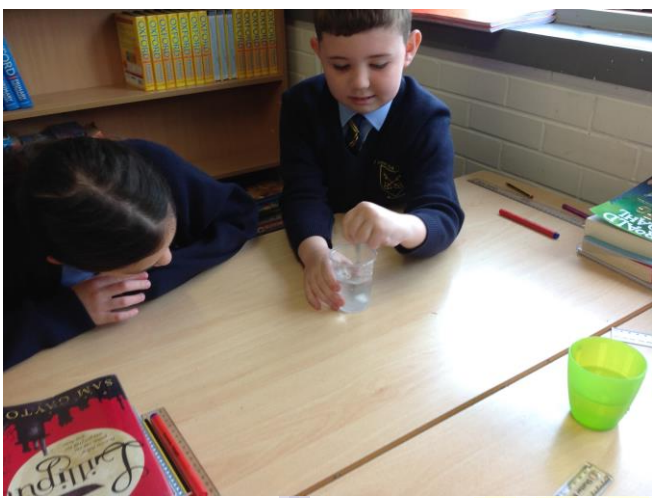
St Mary learning about solutions in science