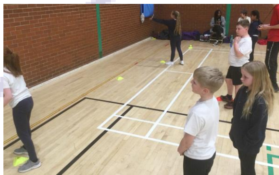
St Peters represented at this week's Value's festival