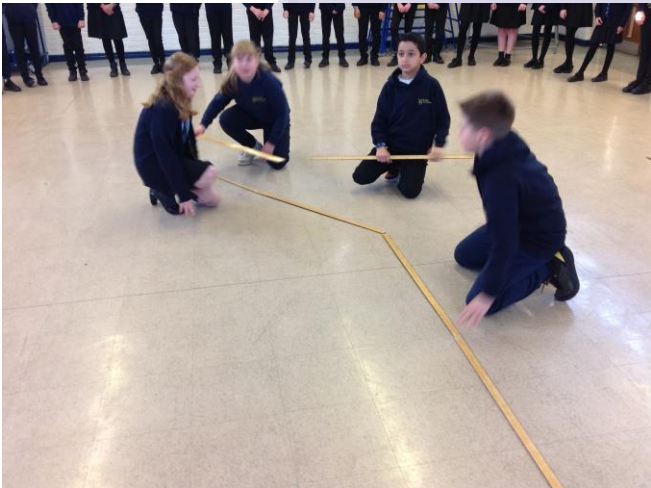
Year 5 maths