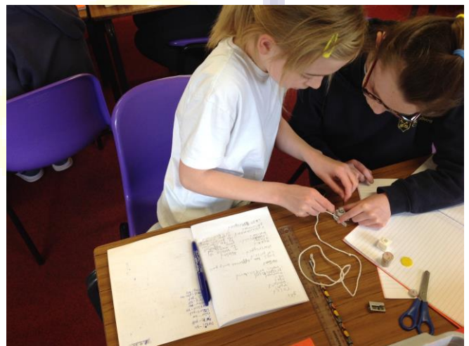
"Let your light shine" Year 5 science lessons are electric!