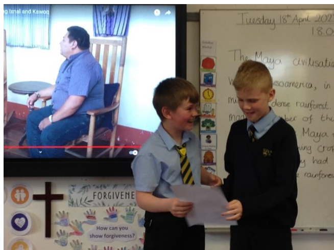
Learning Mayan Phrases in year 5