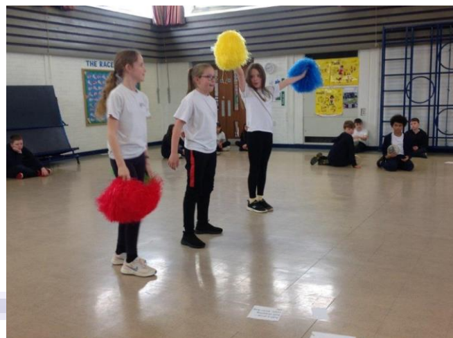
Dance in year 6