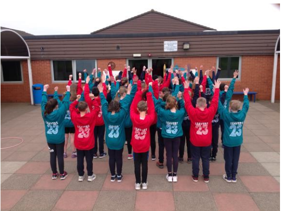
Year 6 leavers hoodies in full Techni-colour!