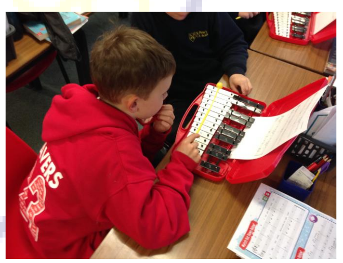
Music lessons in Year 6 learning to play Harry Potter and Star Wars themes!